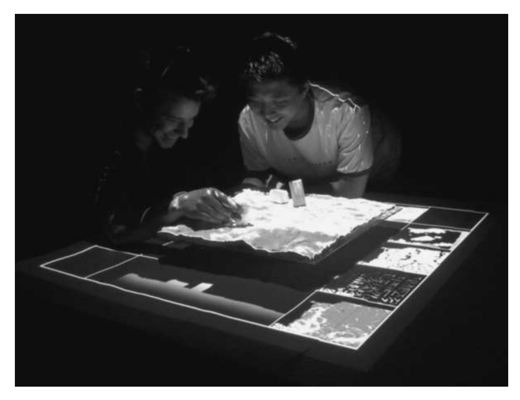
Figure 1 Illuminating Clay: A landscape model made of clay provides the input/output for GIS simulations