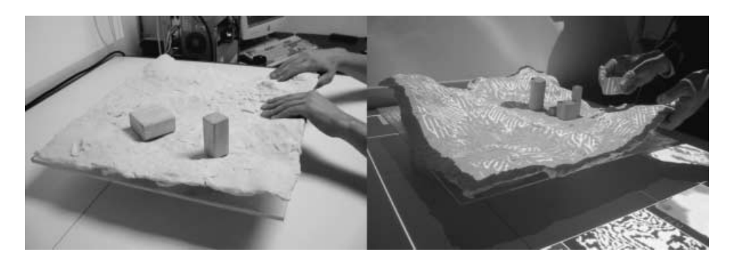
Figure 4 The tangible worktable comprises a landscape model, which is augmented by computer projections. In the Illuminating Clay case, any object from the user's environment can be used for including the user's own hands, pieces of paper, cardboard, foam, plastic or other objets trouvés