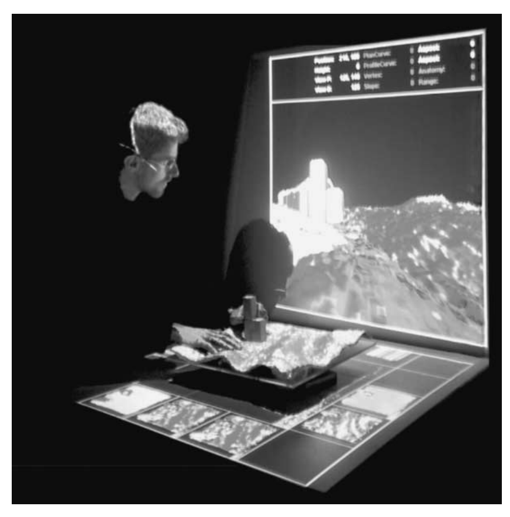
Figure 6 A vertical screen, next to the worktable, provides users with a virtual view of the landscape at human eye level (the image shows Illuminating Clay )

which was once solved with the use of modelscopes. In addition to geometrical information, the 3-D view is texture-mapped with the results of the GIS simulation and is updated in real-time.