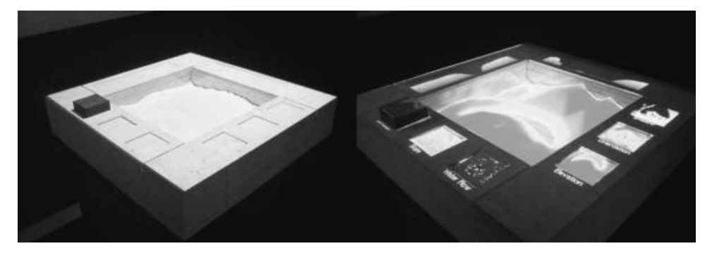
Figure 5 The tangible worktable in the SandScape system. The geometry of the landscape model is defined using glass beads

landscape model. The other thumbnails remain active and are updated in real time with changes of the model, so that users can have a glimpse of the results of different landscape analyses before choosing which one to project in full size. Besides the thumbnails, two cross profiles are also projected on the worktable, helping users understand the 3-D geometry of the terrain.